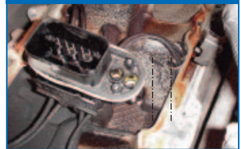
Figure 2: The rear of the engine was wet with fuel, either due to a leak at the #5 poppet or at the CSFI unit. Everything was either resealed or replaced to prevent further problems.

This one may not have been our fault, but it's easy enough to get caught up in the euphoria when a problem vehicle finally seems to be fixed. Make sure it's completely fixed before returning it to the customer. And if it's an OBD II vehicle, try to make all the monitors run to completion at least once after you've made your repairs.