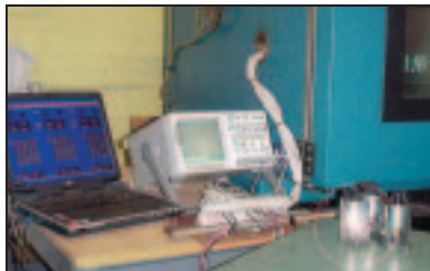
An environmental chamber, dedicated software and other specialized test equipment are used during Wells' component life-cycle testing.

The process begins by placing the component (in this case a digital EGR valve) in an environmental chamber. For this particular component, the chamber cycles the temperature from -40 to +257 degrees F (-40 to +125 degrees C). These are the temperature extremes this component will be exposed to when in service due to the combination